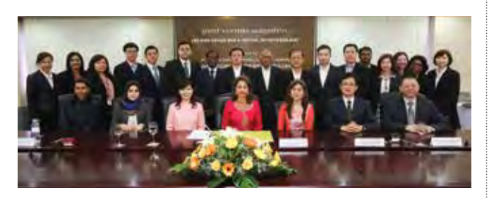
Signing Ceremony witnessed by DYMM Sultanah Pahang Darul Makmur

Group picture of participants filled with excitement.