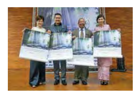
Anugerah Hijau Challenges Youth to Present Innovative Environment Solutions

LBS had organised a community gettogether to bring the residents of BSP together to strengthen bonds and its sense of community for positive change towards a sustainable community.