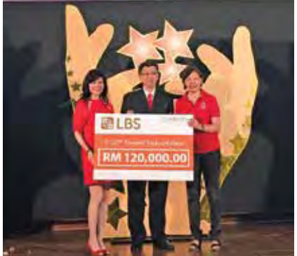
32<sup>nd</sup> Kiwanis Treasure Hunt

LBS sponsored RM120,000.00 for the 32<sup>nd</sup> Kiwanis Treasure Hunt.