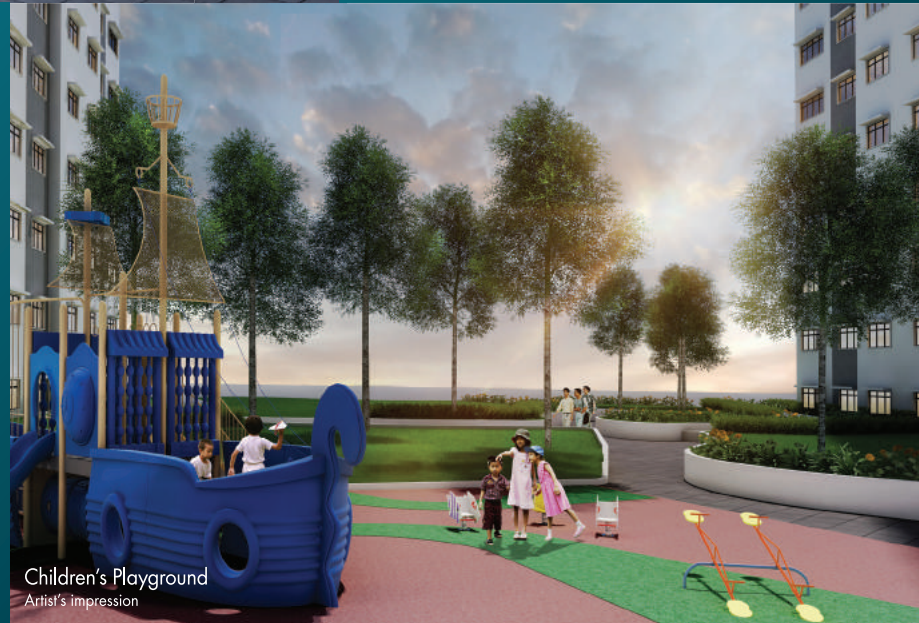
Children's Playground Artist's impression

with available amenities such as playgrounds, a prayer room, kindergartens, nurseries, a multipurpose hall and seating areas – everything a young family would need to feel at home.