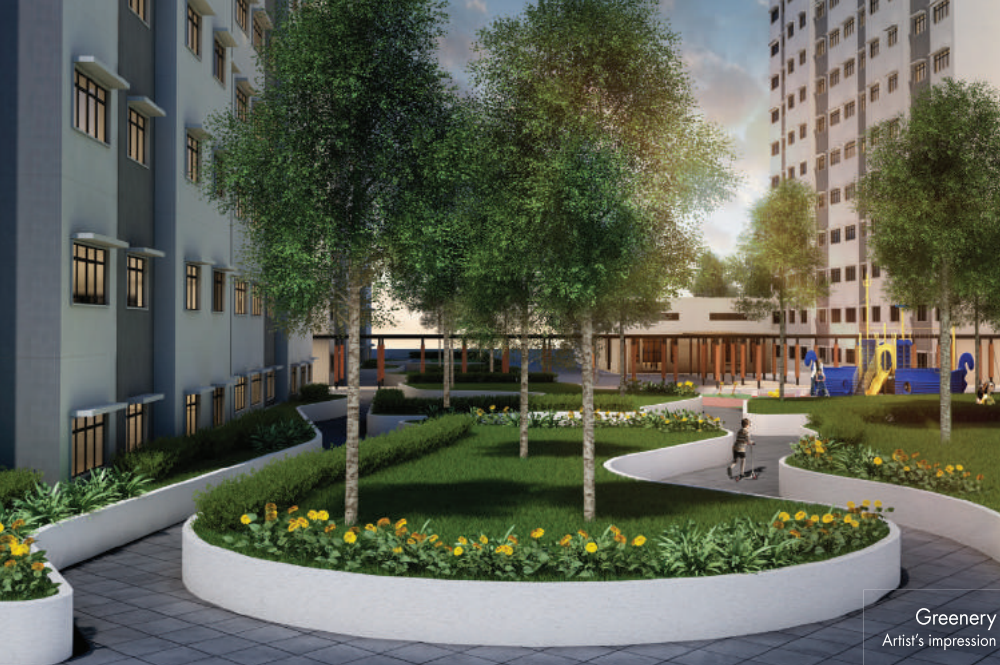
Greenery Artist's impression