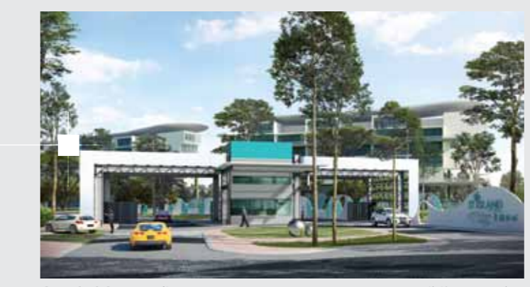
Guarded Community Artist's Impression