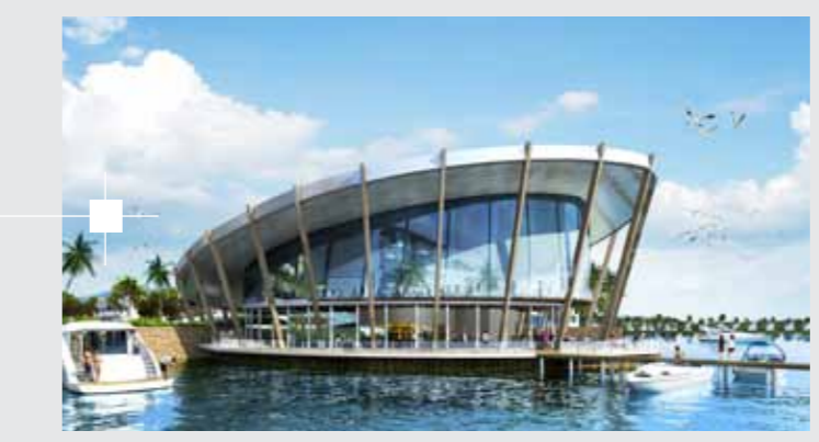
Clubhouse Artist's Impression