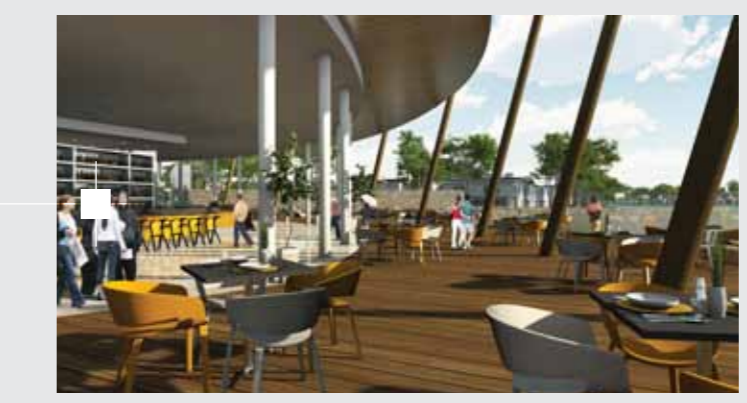
Lakeside Cafe Artist's Impression