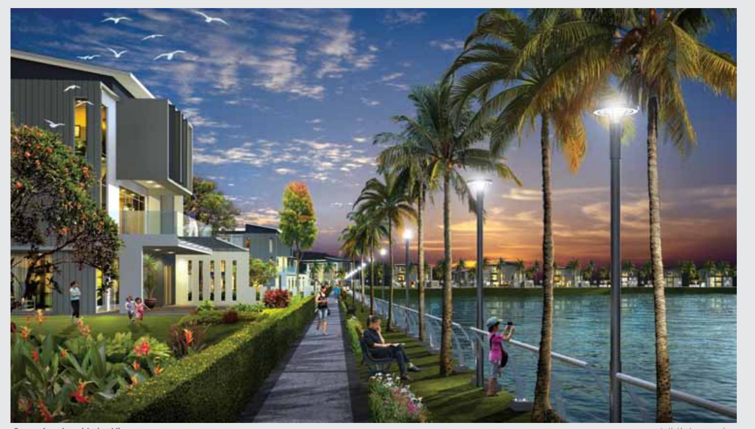
Bungalow Land Lake View Artist's Impression

The clubhouse features first-class leisure and recreational facilities; be it a leisure swim, a pleasant soak in the sun, or an intensive work-out, D' Island Residence has everything a modern active lifestyle requires.