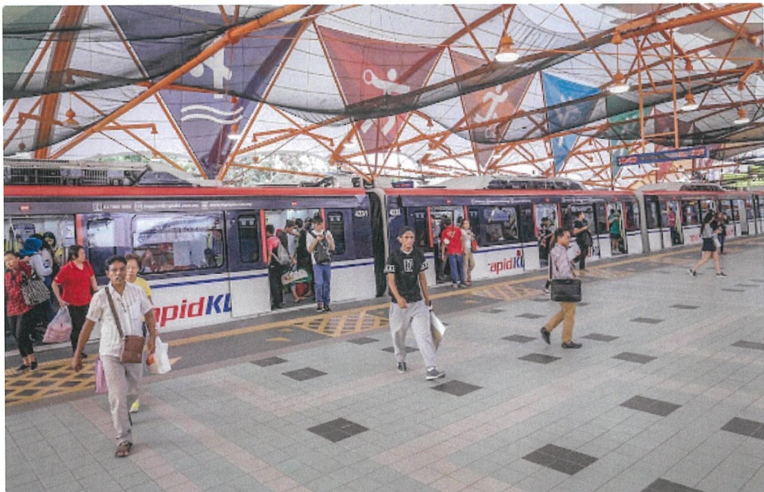
Passengers exiting a train carriage at the Bukit Jalil LRT station. — Picture by Firdaus Latif.

This makes it easy for people to reach places like the upcoming Bukit Jalil City Mall, Paradigm Mall and the Giant Hypermarket in Bandar Kinrara, as they are all just a short drive away.