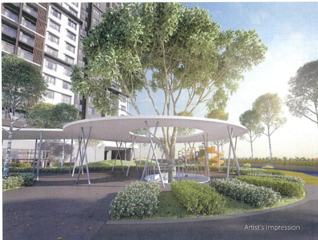
An artist's impression of one of the leisure activity stories with facilities spread across seven floors.

RBBJ also will have more than 90 facilities for their residents, which include a swimming pool and other family-themed pools, Maze Garden, Bintang Tree Pavillion, playgrounds and an aqua gym. Another notable facility in RBBJ is the Super Ramp — conveniently designed for residents who park on the higher parking floors to access the even-numbered floors of the nine-level car park, hence reducing travel duration.