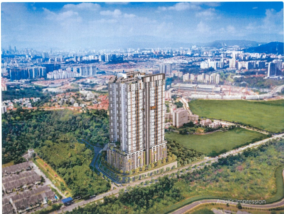
An illustrated impression of Residensi Bintang Bukit Jalil.

Among the many family-friendly places to live in Bukit Jalil is the sought after Residensi Bintang Bukit Jalil (RBBJ).